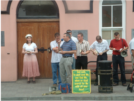
Youth Council Outreach open Air in Kinsale, Co. Cork. Summer 2005